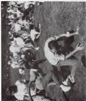
'Leapfroggers' show team spirit at 'Fest'.

Remember, every laundry has a lost and found. Take advantage of this—in actual fact, abuse the privilege if you can. The clothes are all free, and best of all, they're all clean. Well, I've shared a few of my secrets with you, and I hope they are as useful to you as they've been to me.