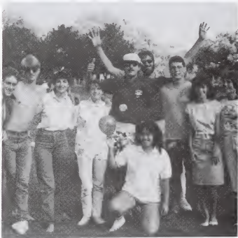
The George Brown spirit prevailed at Orientation week's Islandfest.

**More on Islandfest and Rock 'N' Roll Heaven inside.